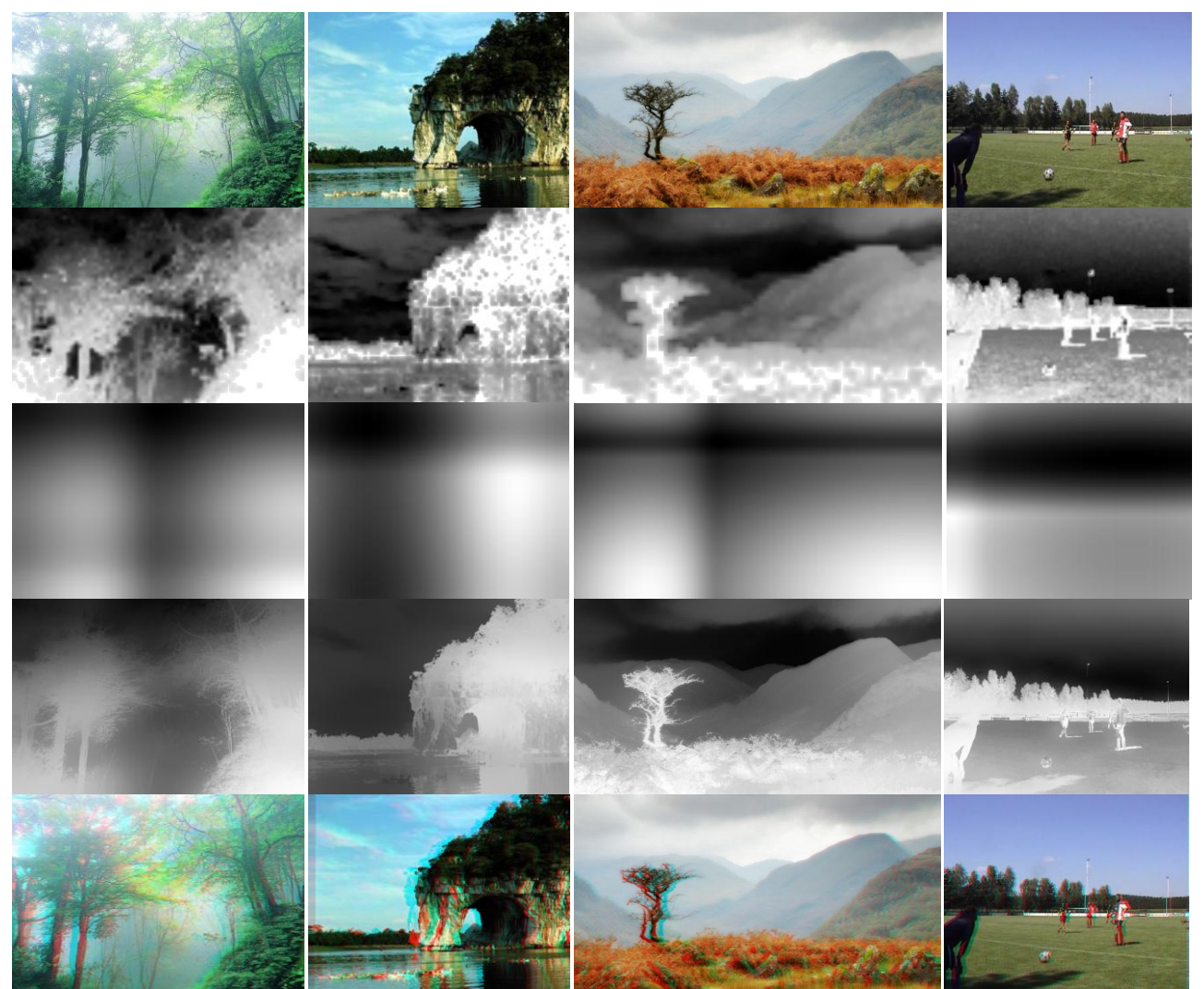
Figure 3. Experimental result of our proposed system.