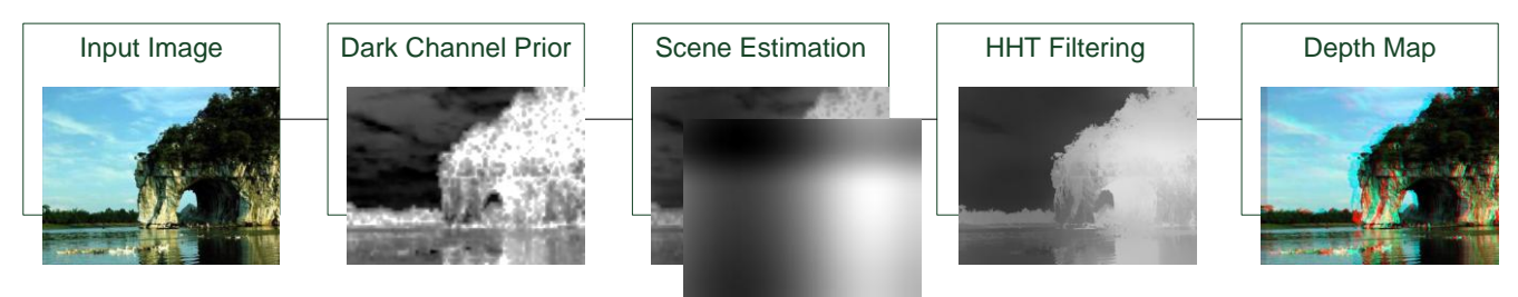
Figure 1. Proposed 2D to 3D conversion system

Traditional dark channel prior is very sensitive to noise signal, therefore may cause cue confliction on some region. We use scene estimation to analyze global depth intensity and can remove so local noise caused by dark channel. According to dark channel prior, we choose the highest value and lowest value for scene